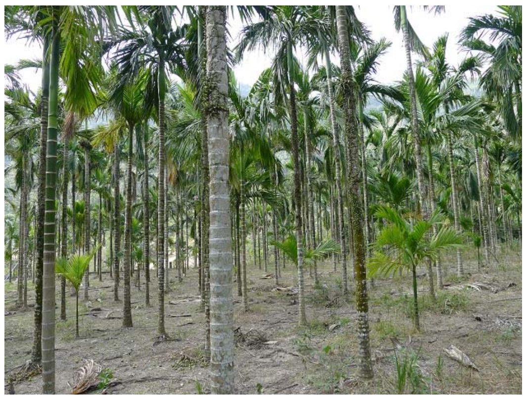
Stand (forest community) level

Annex 4 Typical photos of ecotourism attractions in stand (forest community) level