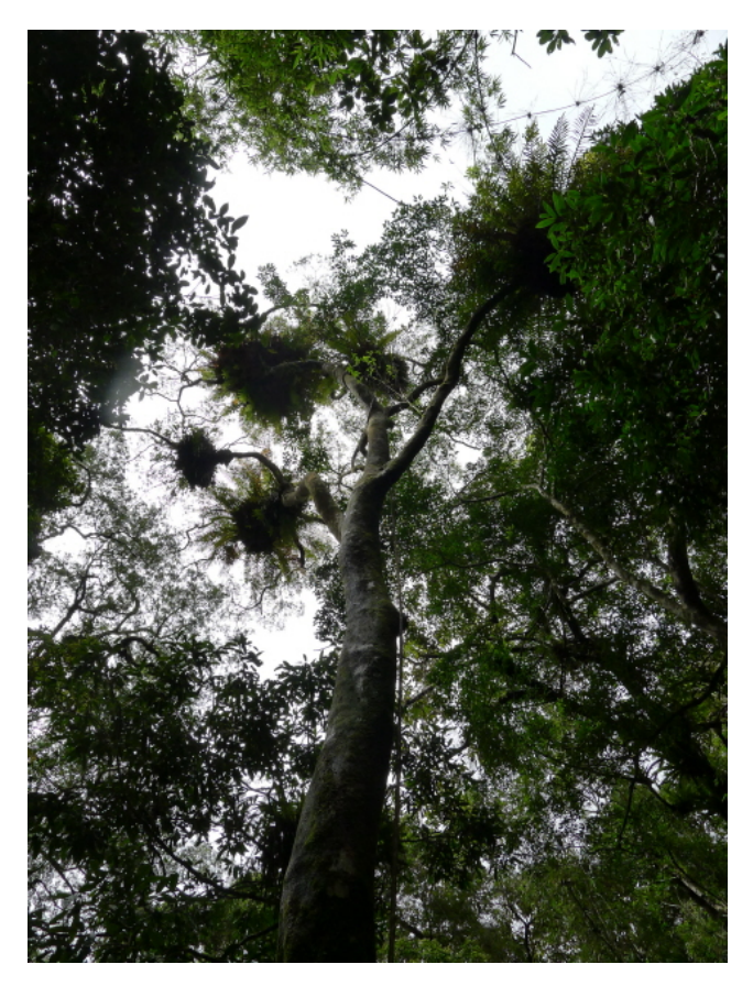
Gardens in the air