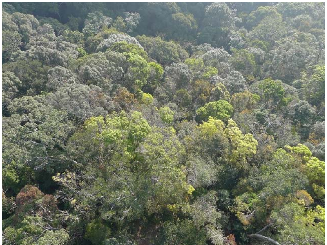
Stand (forest community) level