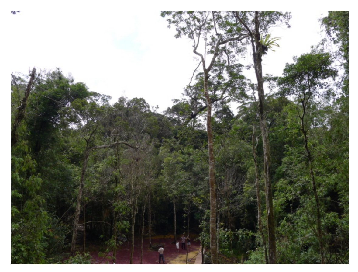
Stand (forest community) level