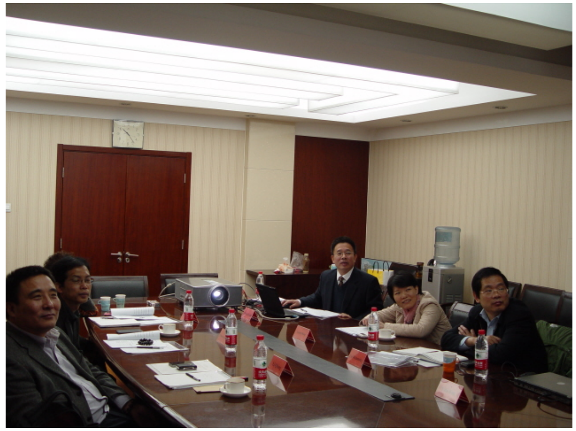
First PTC meeting