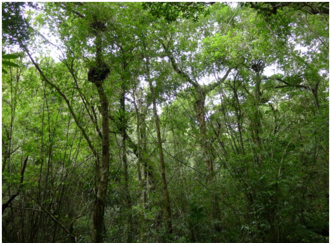
Stand (forest community) level