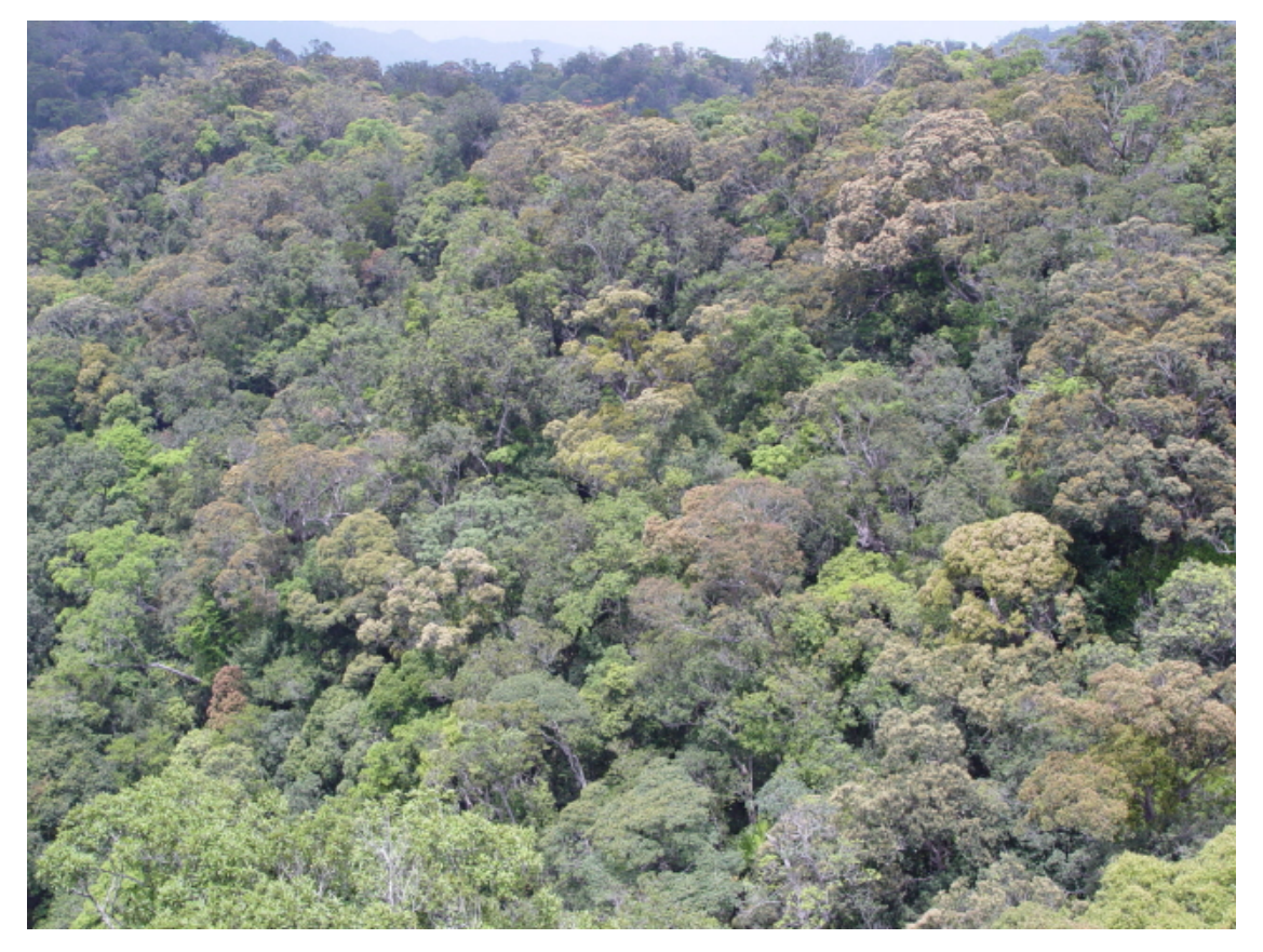
Stand (forest community) level