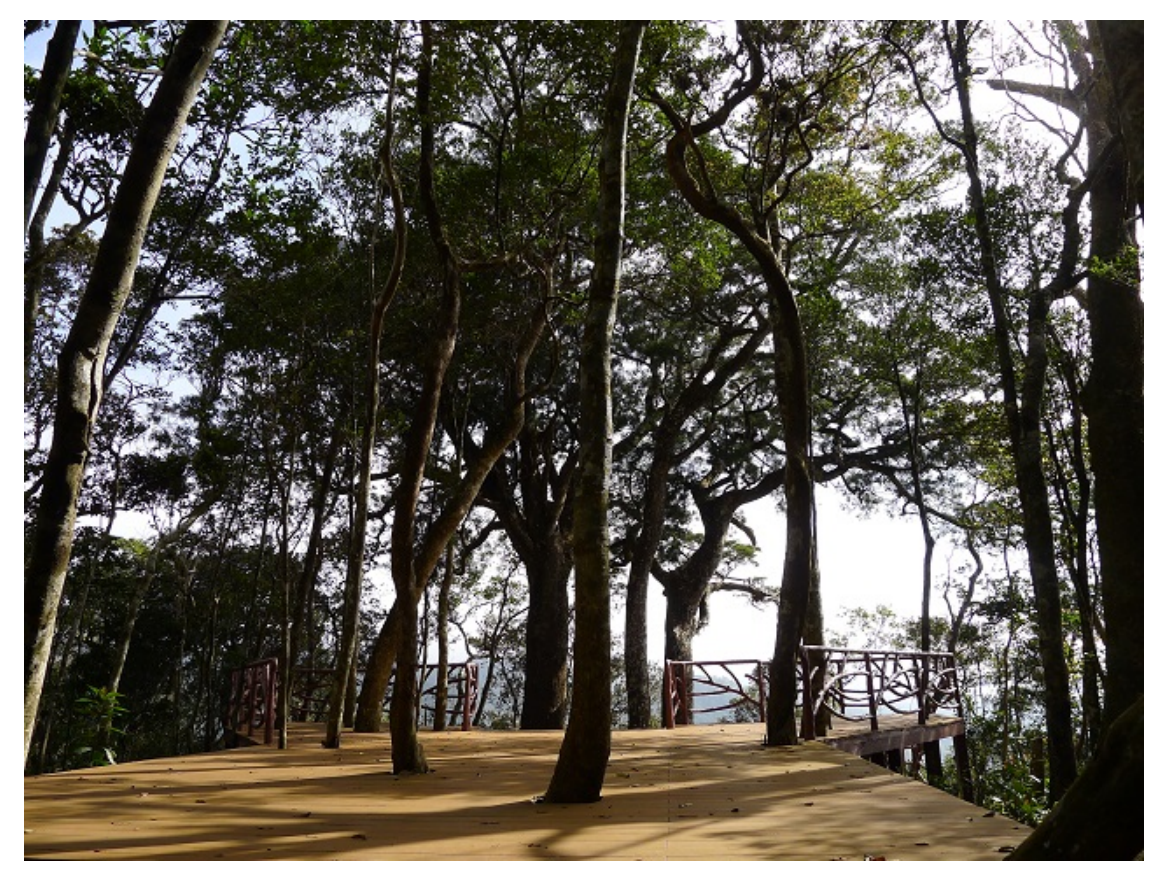
Stand (forest community) level