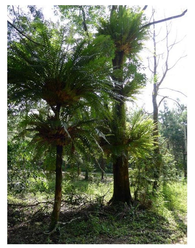
Gardens in the air